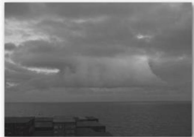
The Mediterranean Sea near the Strait of Gibraltar on April 18, 2017

I love to travel, but hate to arrive. —Albert Einstein