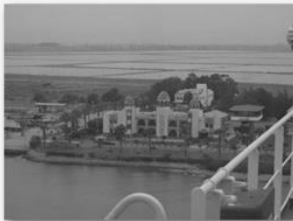
Customs at Port Said, Suez Canal, northbound April 11, 2017

Journal entry Day 35 Saturday April 01, 2017